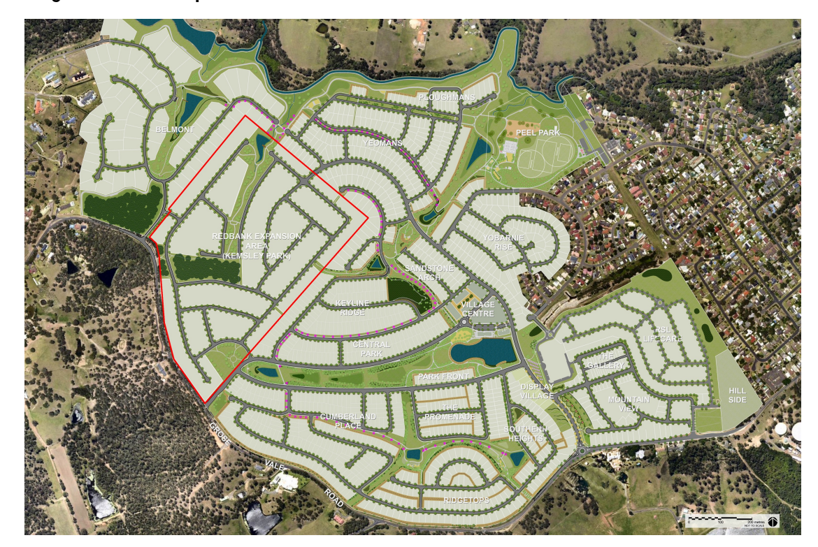
Figure 1. Redbank expansion area