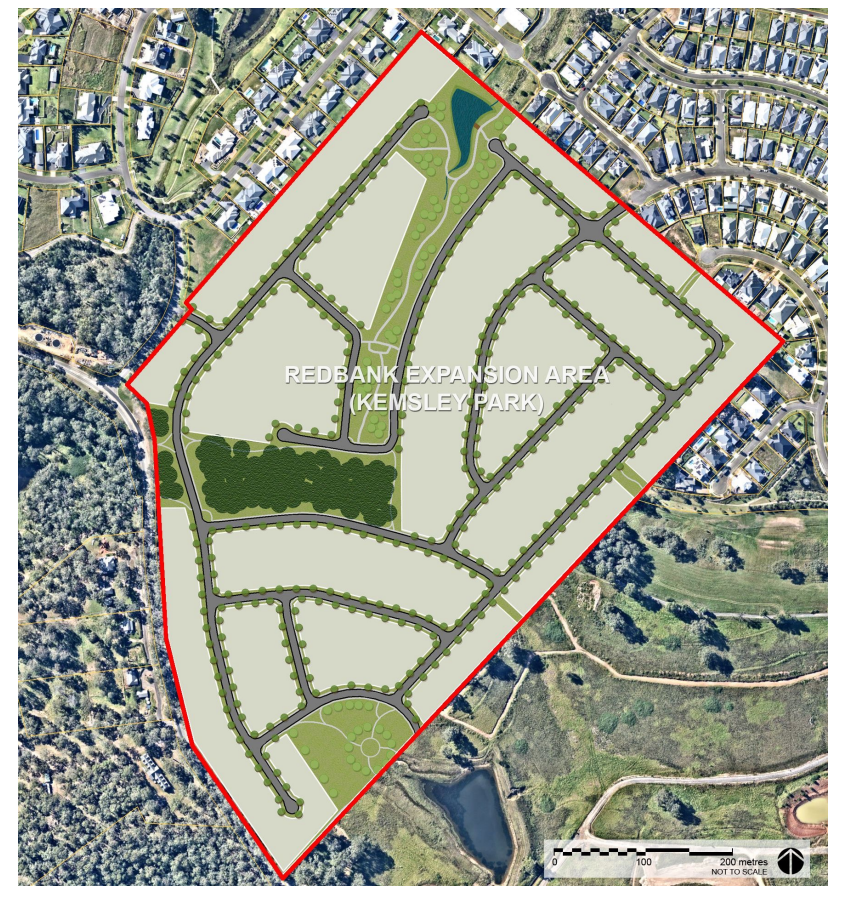
Figure 2.1. Site context