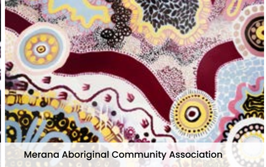
Merana Aboriginal Community Association