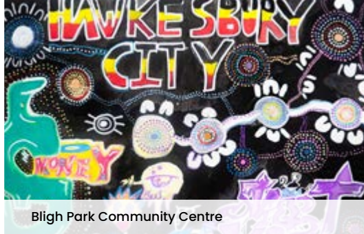
Bligh Park Community Centre