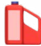
Motor oils, fluids & fuels