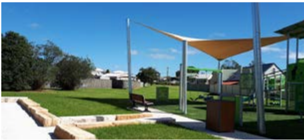
The upgrade of Pitt Town Memorial Park was completed, with new playground, paths, and landscaping