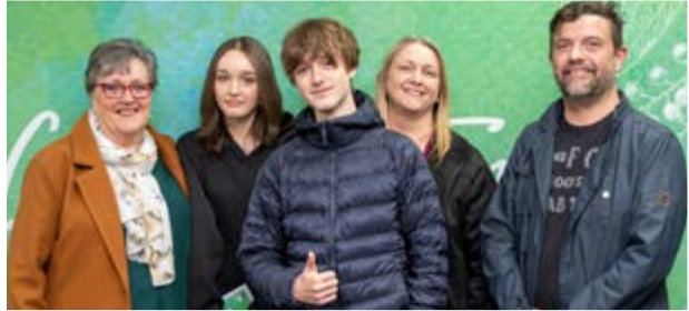
11 residents became Australian citizens at our May ceremony