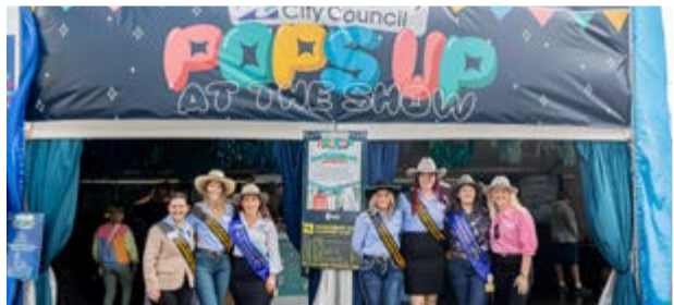
More than 17,000 people visited our Council tent at the Hawkesbury Show