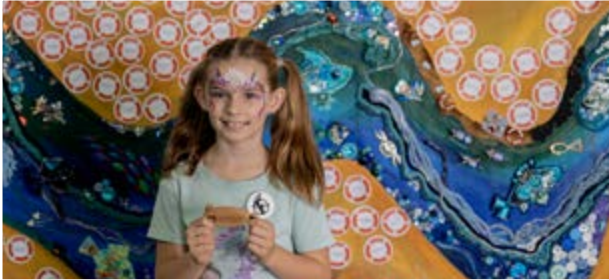
450 people pledged to be river safe on the Hawkesbury River at the Hawkesbury Show

Council is delivering programs and infrastructure to make the Hawkesbury a great place to live. Here is a quick snapshot of Council's work.