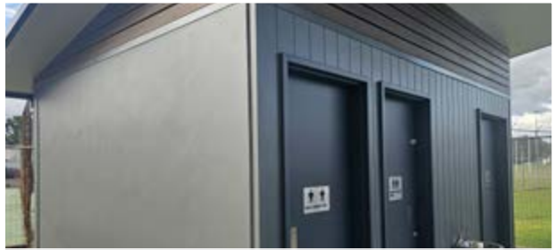
The amenities block at Turnbull Oval North Richmond was replaced following fire vandalism