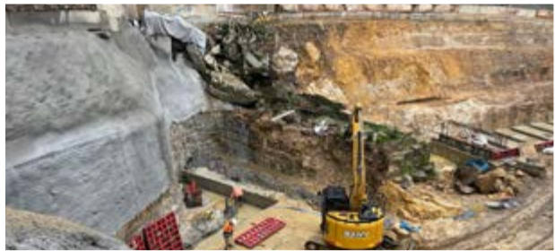
Works continued on restoring local roads, including the historic Thomas James Bridge at Lower Macdonald