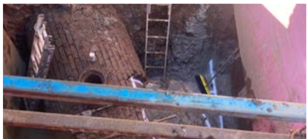
Council preserved a heritage brick drain on The Terrace at Windsor during repairs to a stormwater pipe and culvert