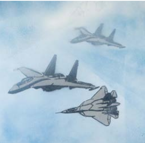
Kuyper Christian School