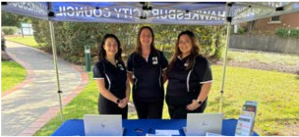
Our Customer Experience Team popped up at Bilpin, Colo Heights and Richmond