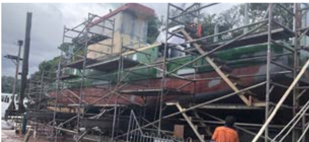
Lower Portland Ferry overhaul was completed, ahead of its transfer to State Government management