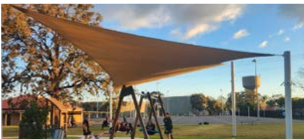
Shade sails were installed at South Windsor and Colonial Reserve playgrounds