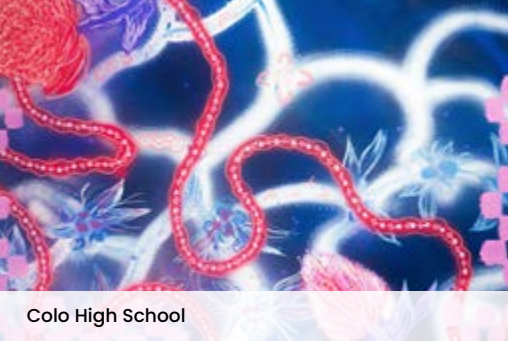
Colo High School