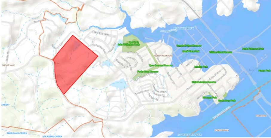
Figure 5 - Probable Maximum Flood Level