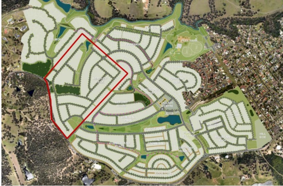
Figure 8 - Kemsley Park Master Plan blended with Redbank Development

As detailed in the Planning proposal, the key features of the master plan include: