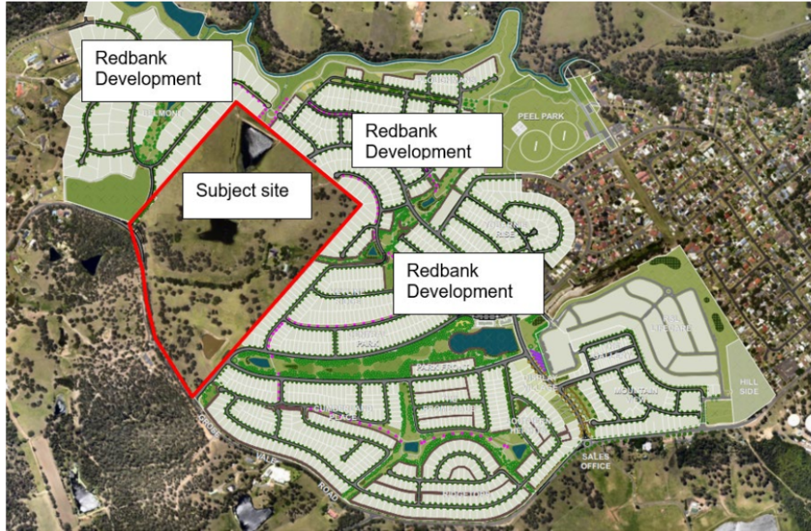
Figure 2 - Subject site and Surrounding Redbank Development