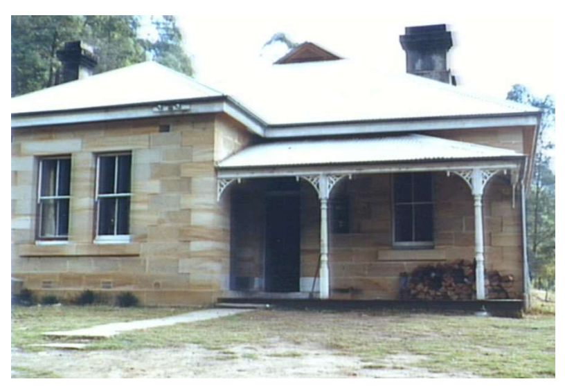
Former Court House and Police Station, St Albans circa 1980s

St Albans Court House operated in the 1850s. St Albans Court of Petty Sessions within the Windsor Police District was created in 1858 and remained in use until 1933. The records were moved to Wisemans Ferry Court of Petty Sessions and some of these are held by State Records see <a href="https://search.records.nsw.gov.au/permalink/f/1ebnd1l/ORGANISATIONS1002827">https://search.records.nsw.gov.au/permalink/f/1ebnd1l/ORGANISATIONS1002827</a> In the 1890s a Court House building was constructed in St. Albans, replacing an earlier building which was damaged by floods. This building now operates as a Bed & Breakfast.