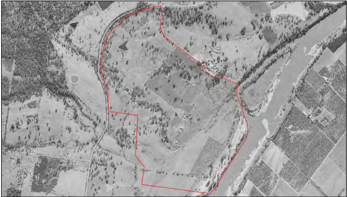
Figure 5 1984 aerial photograph of the Project area