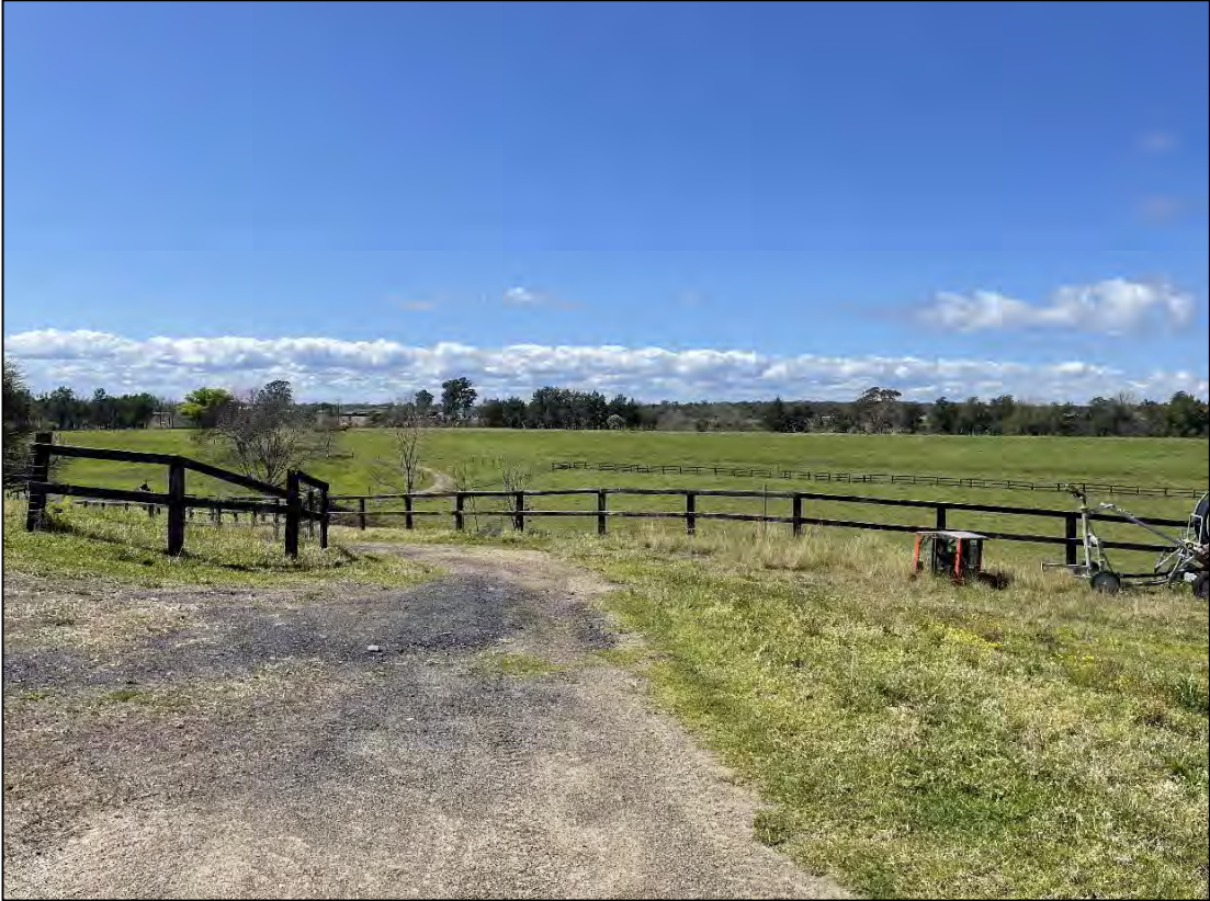
Plate 7: View east from homestead across large terrace