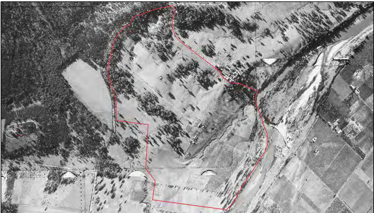
Figure 4 1975 aerial photograph of the Project area