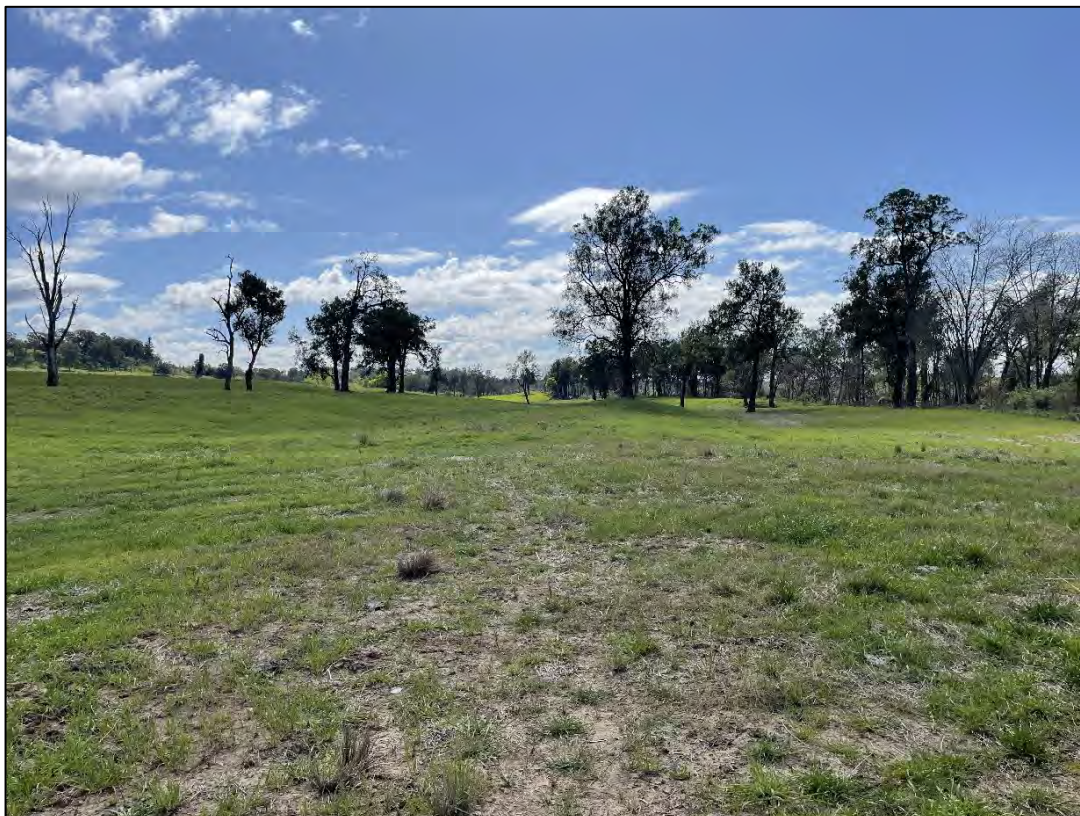
Plate 2: View northeast showing an area of enhanced visibility