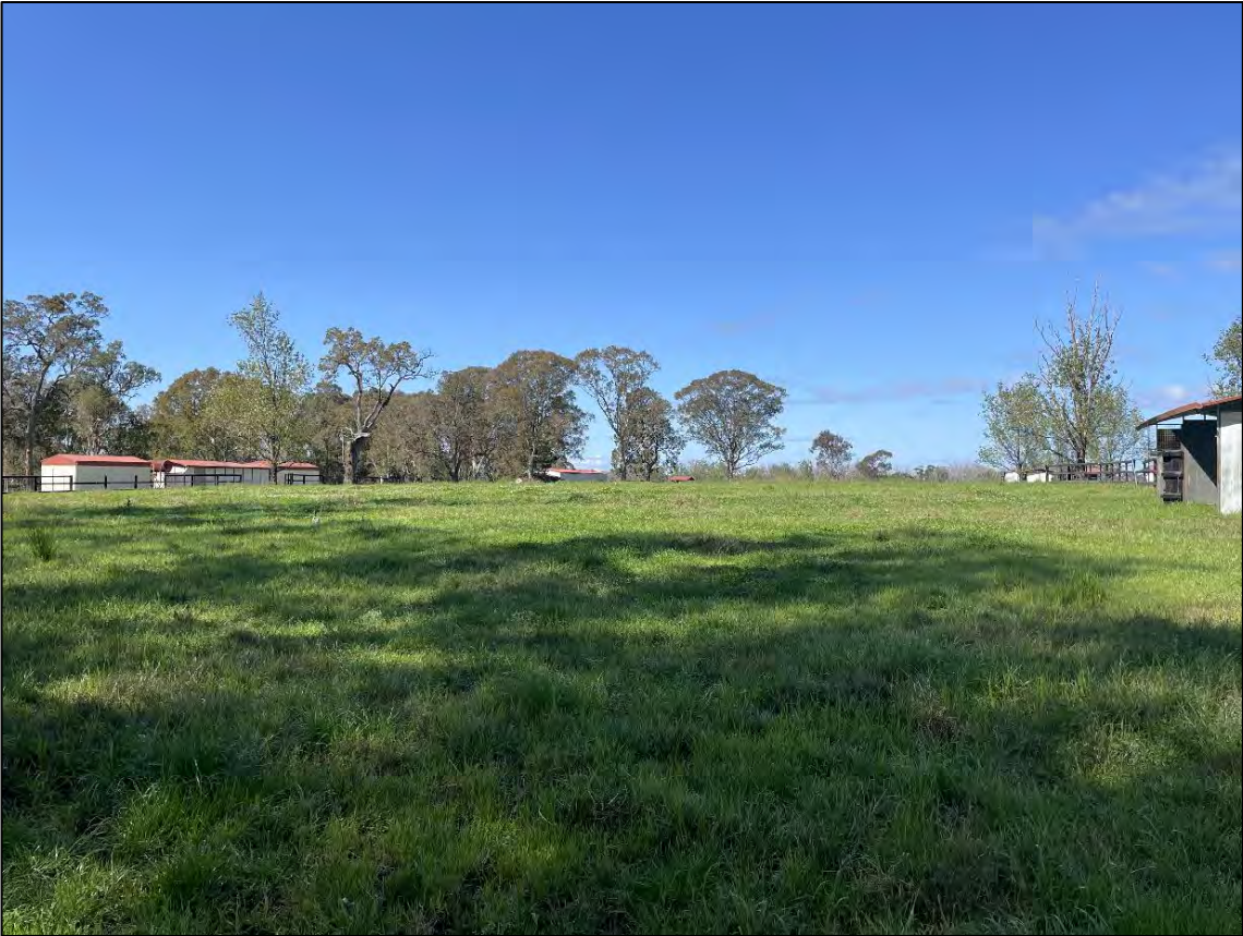
Plate 10: View southeast of creek flat