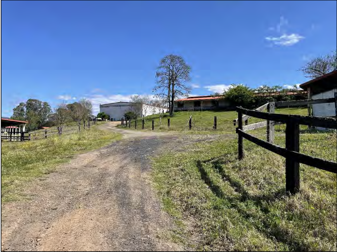
Plate 3: View west showing farm buildings