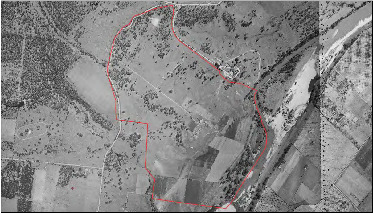
Figure 3 1961 aerial photograph of the Project area