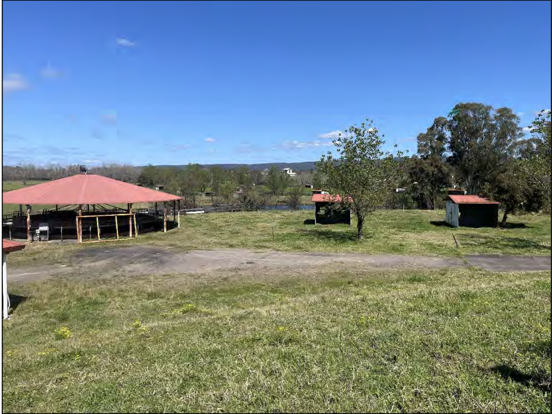
Plate 9: View southwest of the small terrace where the homestead is situated