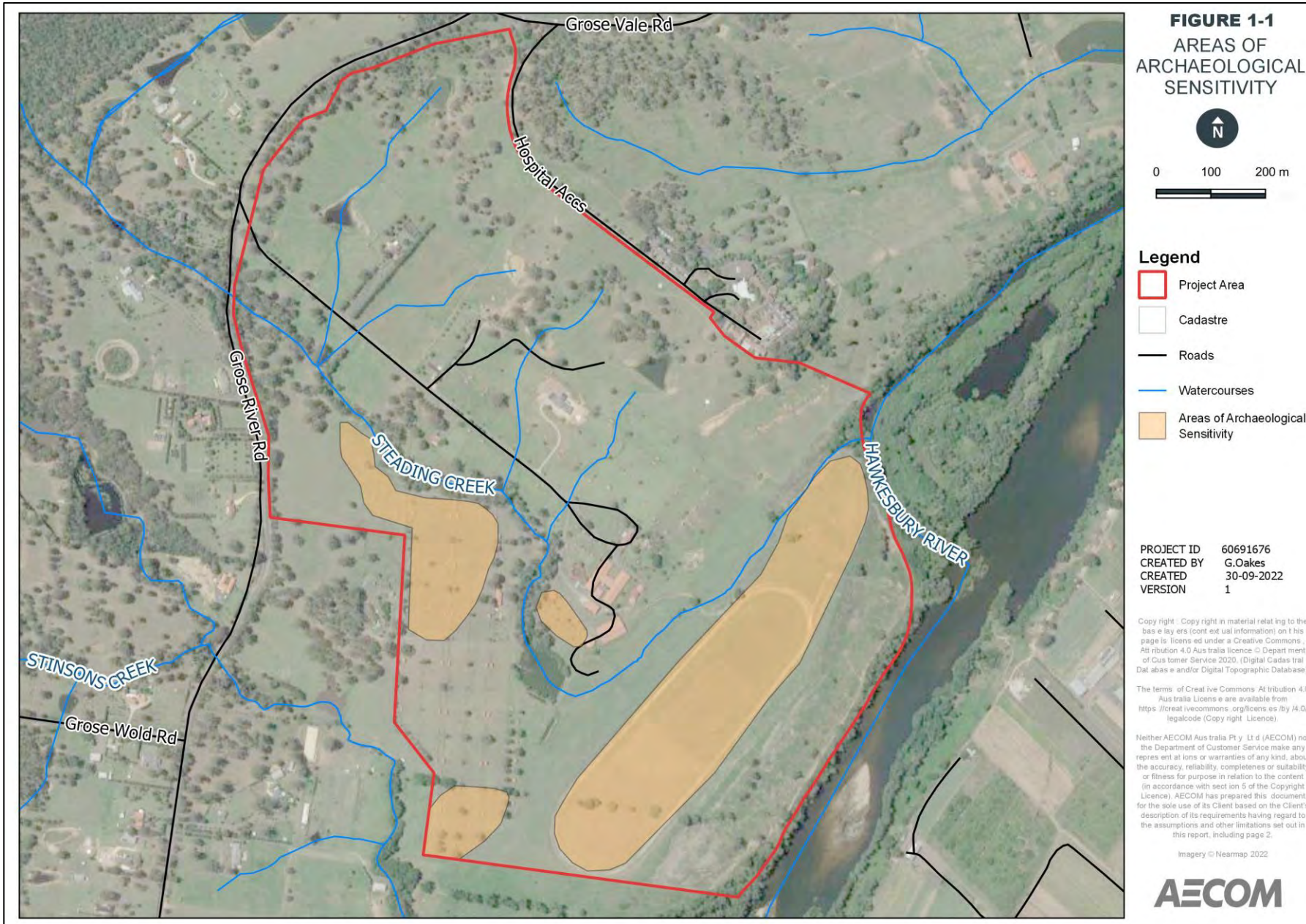
Figure 8 Areas of archaeological sensitivity