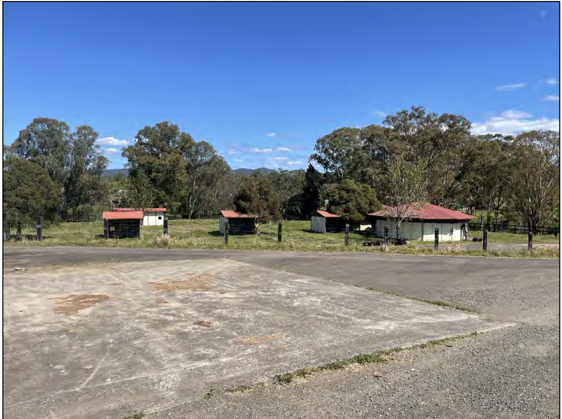
Plate 4: View southwest showing road and buildings