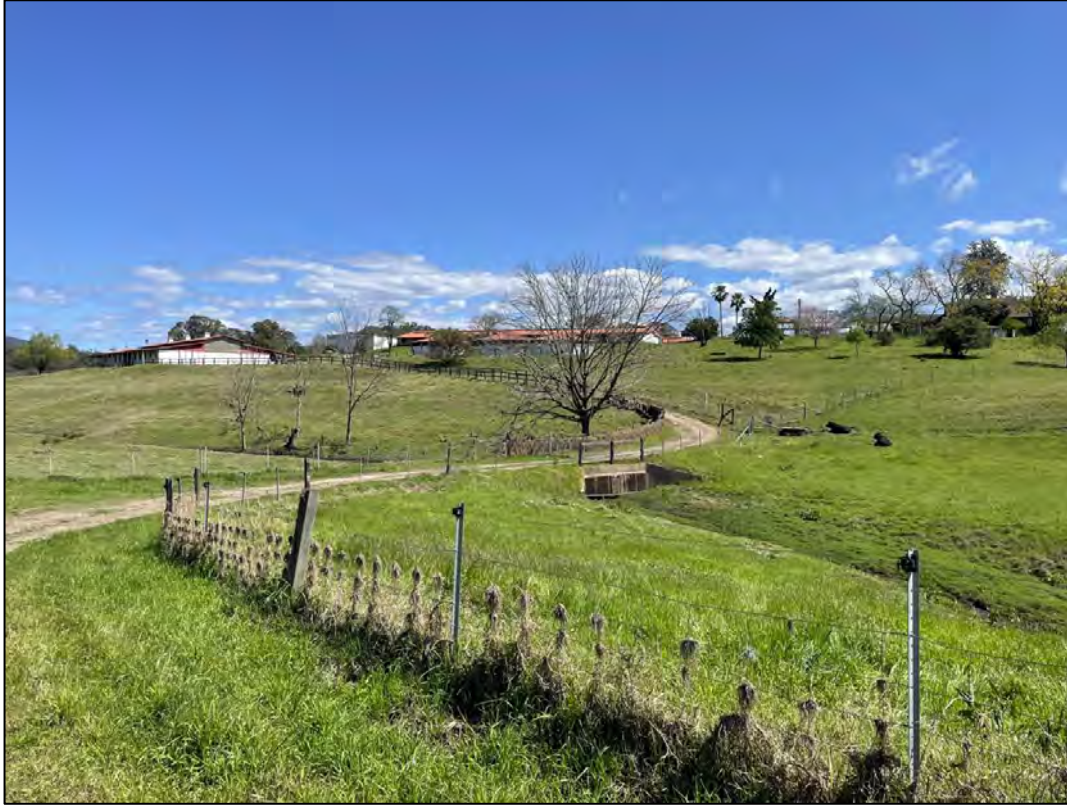
Plate 11: View of grass build-up on the large terrace from recent flooding