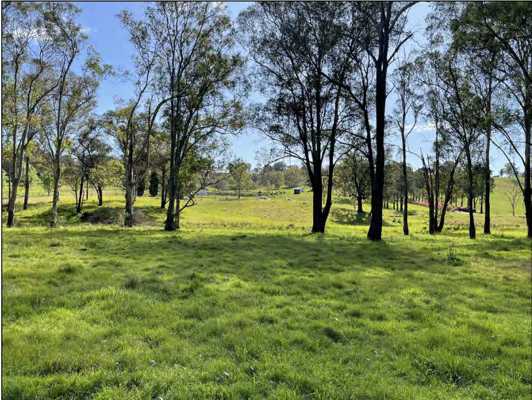
Plate 1: View north of the northern part of the Project area