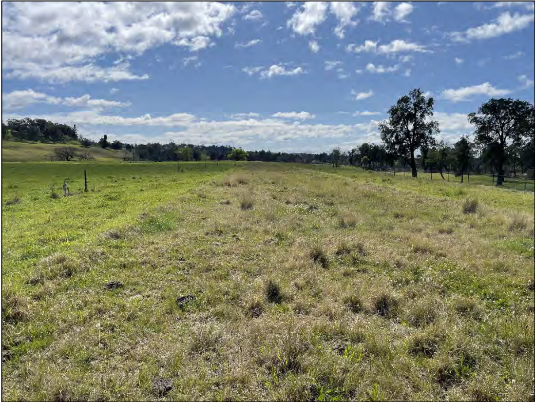
Plate 6: View northeast of the race track