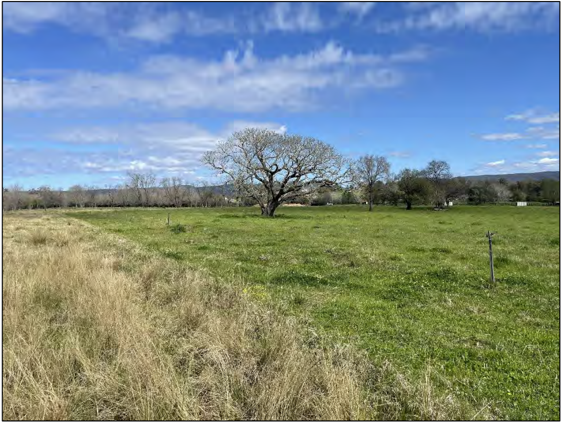
Plate 8: View southwest across the large terrace