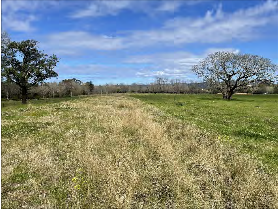
Plate 5: View southwest showing race track