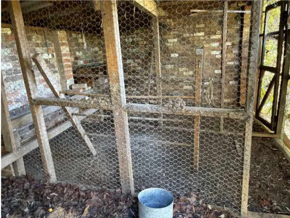
PHOTO 7 View inside the former chicken coop.