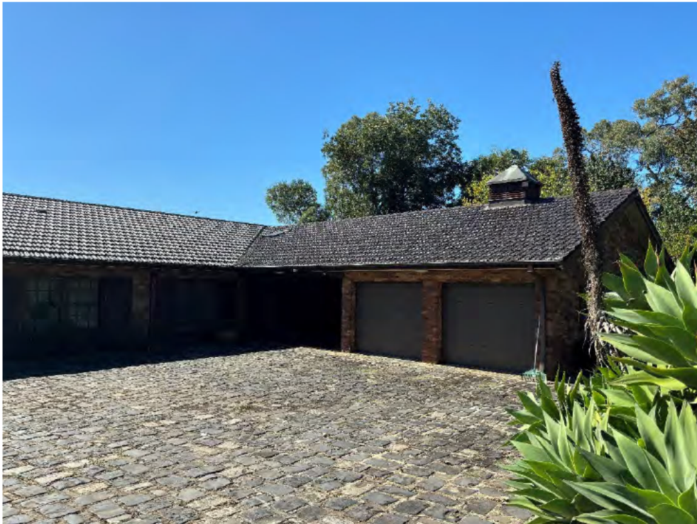
PHOTO 5 On-site residential dwelling.