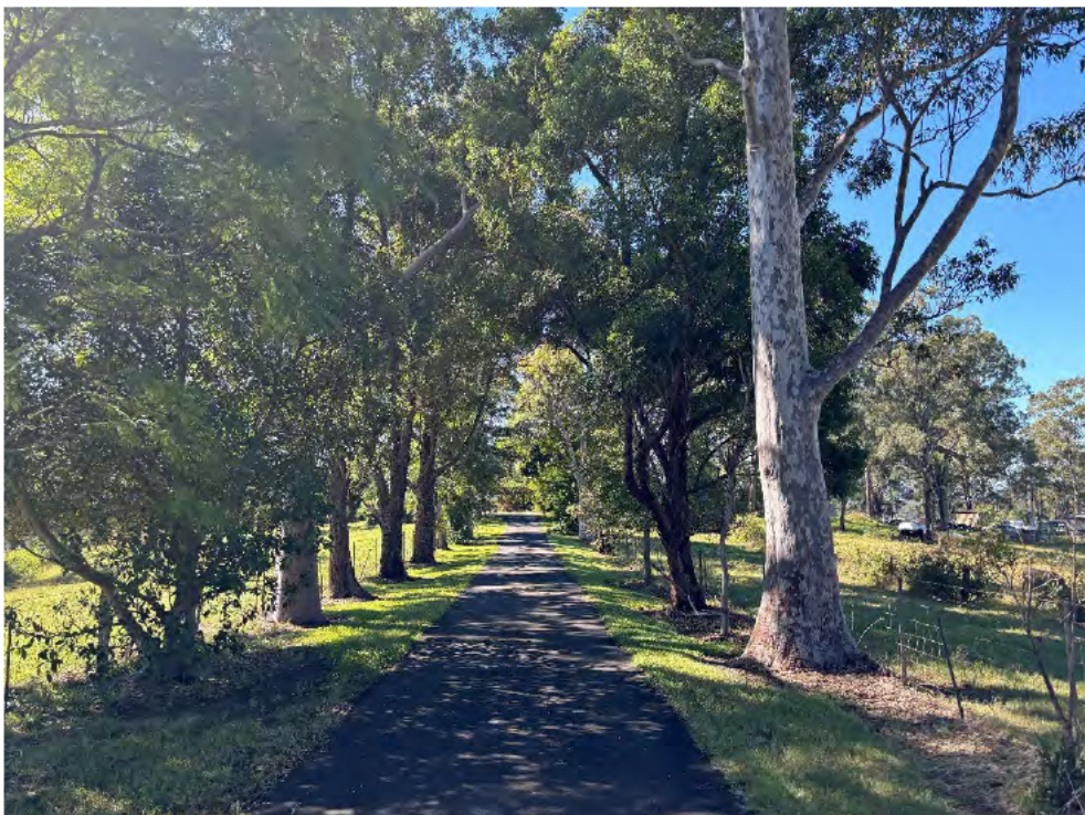
PHOTO 4 View east of the private driveway on-site