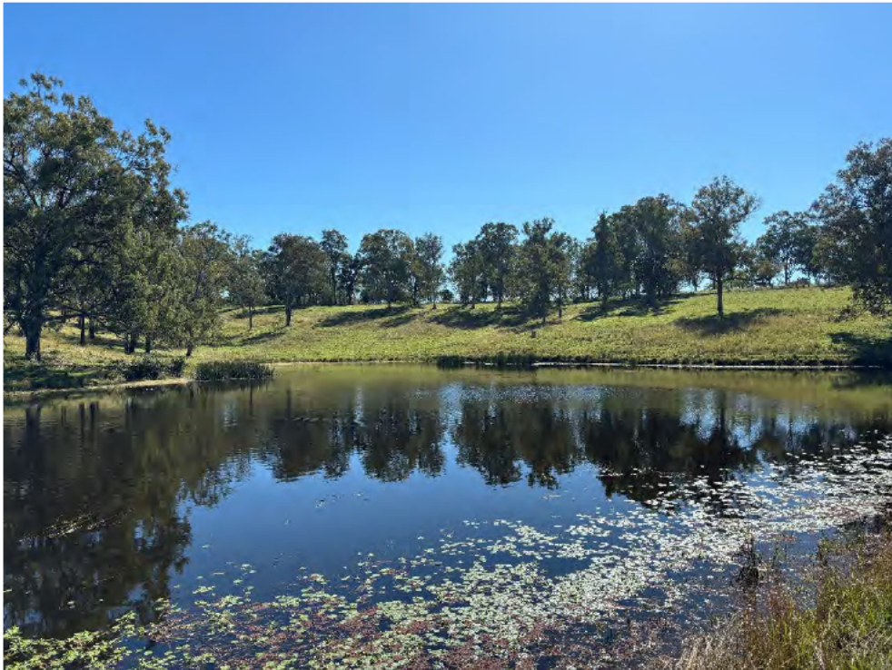
PHOTO 1 View of the dam at the southern boundary.