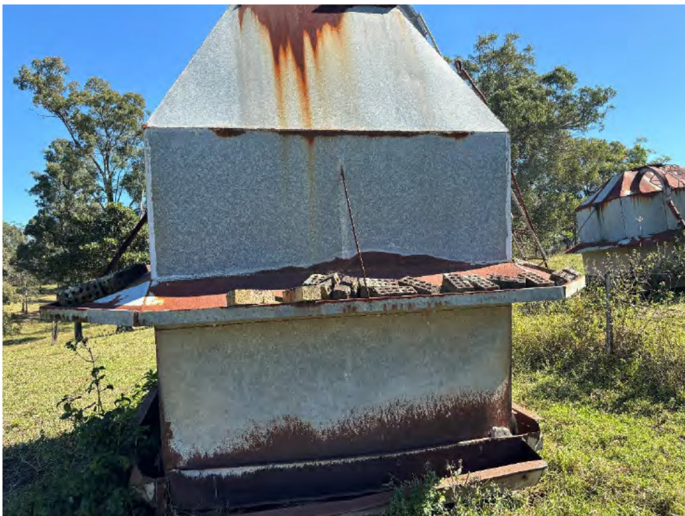
PHOTO 2 Redundant cattle grazing infrastructure