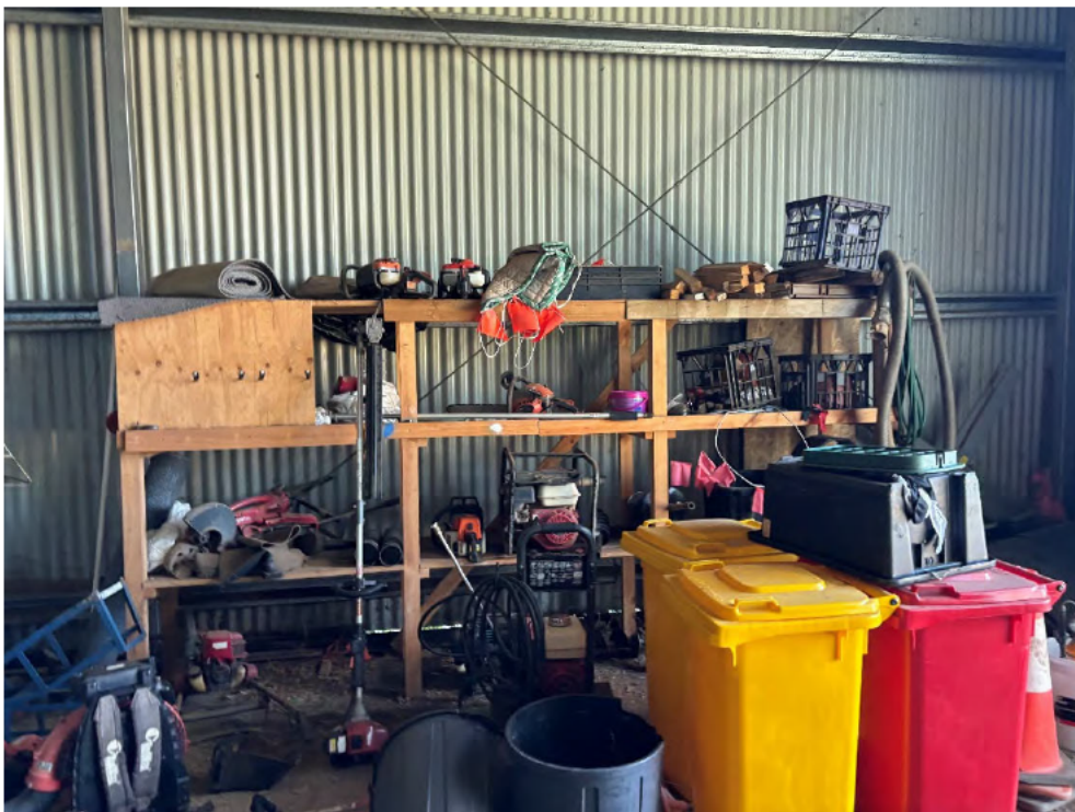
PHOTO 10 Storage of maintenance equipment.