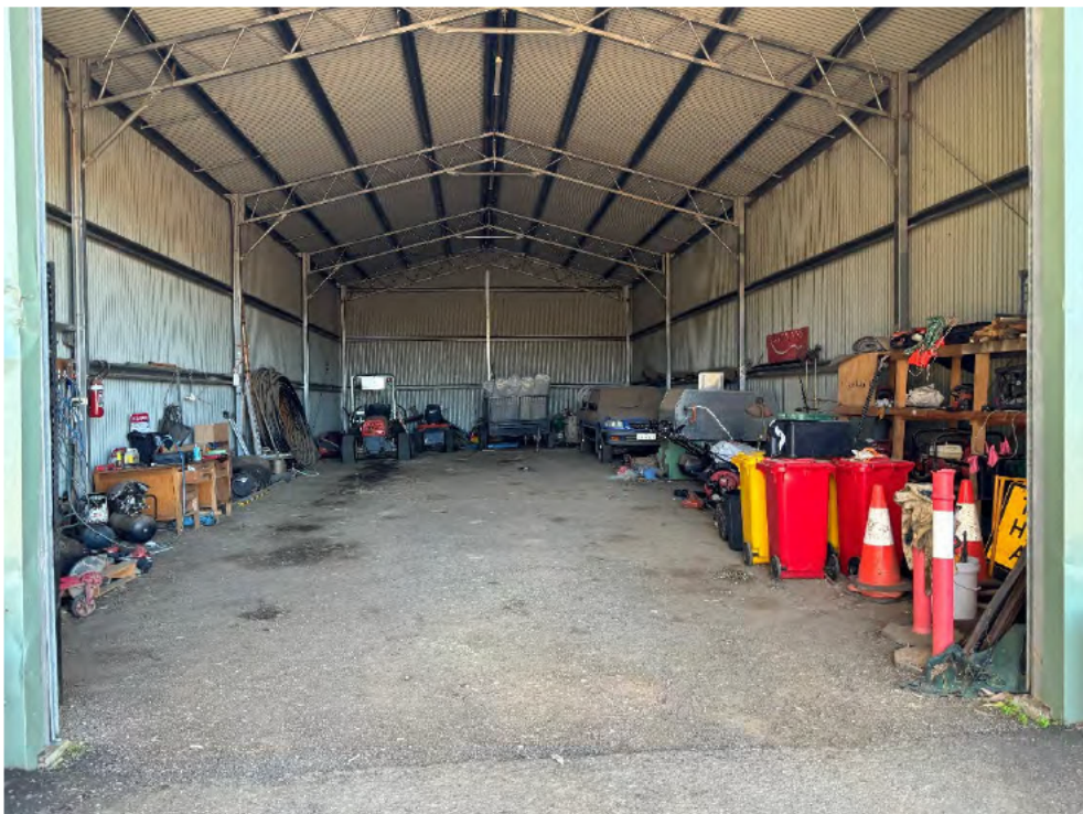
PHOTO 8 View inside the tin shed including ride-on machinery, defunct car, storage of chemicals, fuels and equipment.