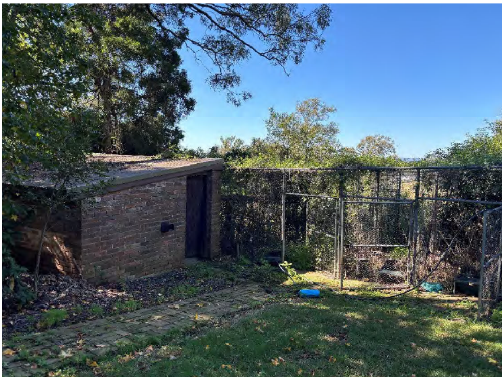
PHOTO 6 Former Orchard and Chicken Coop behind the tine shed.