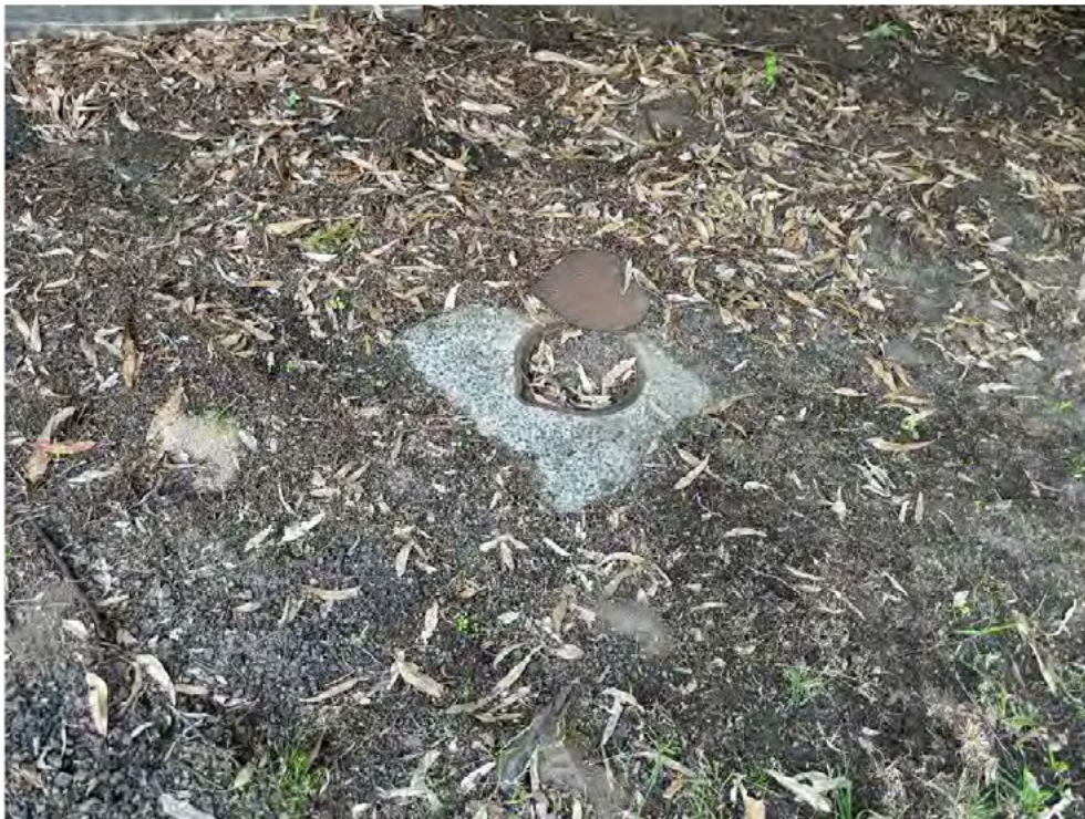
PHOTO 14 Fill / dip point in front of the fuel dispenser