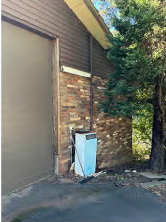
PHOTO 13 Observed fuel dispenser and vent for the UST