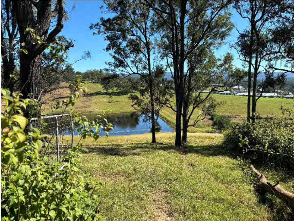
PHOTO 3 View north-west of the central dam.