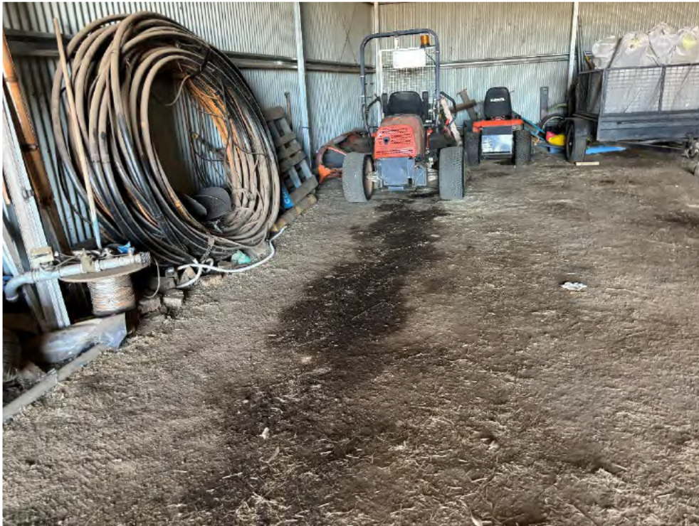
PHOTO 9 Observed staining on the inside of the tin shed.