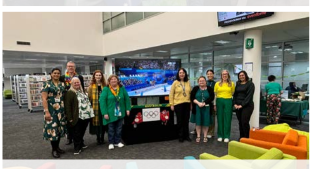
Hawkesbury Central Library was an official Olympics and Paralympics live site